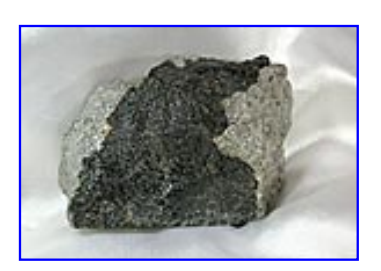
LOT NUMBER 17 WITNESSED FALL