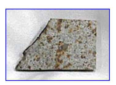
Wold Cottage Stone (L6) 7.4 grams with crust Dimensions: 4mm x 21.5mm x 35mm