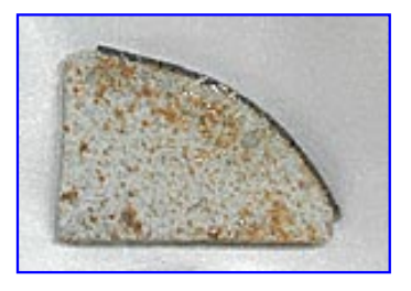
LOT NUMBER 66 WITNESSED FALL

Linum Stone (L6) 6.3 grams with crust Dimensions: 2.8mm x 26mm x 37mm Bradenburh, German Fell September 5, 1854