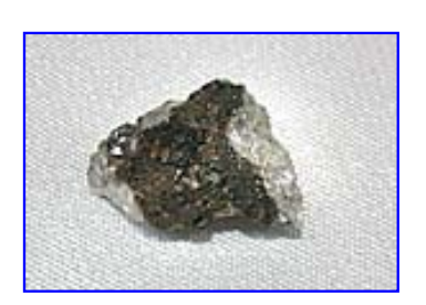
LOT NUMBER 22 WITNESSED FALL