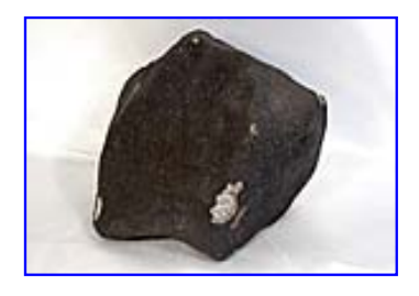
LOT NUMBER 63 WITNESSED FALL

Holbrook 96% fresh fusion crust, hand picked from AMNH. Exceptional!