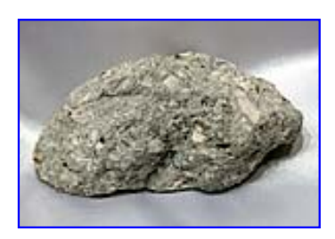
LOT NUMBER 5 WITNESSED FALL