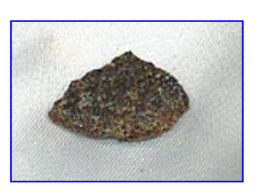
LOT NUMBER 8 WITNESSED FALL