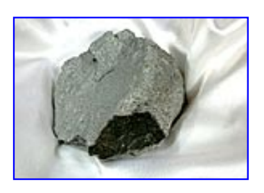
LOT NUMBER 43 WITNESSED FALL

Ochansk With original Russian museum label