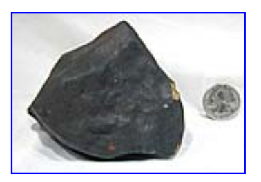
LOT NUMBER 67 WITNESSED FALL

Linum Stone (L6) 6.3 grams with crust Dimensions: 2.8mm x 26mm x 37mm Bradenburh, German Fell September 5, 1854