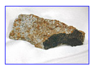
LOT NUMBER 73 WITNESSED FALL