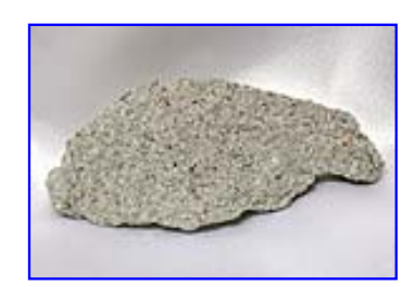
LOT NUMBER 18 WITNESSED FALL