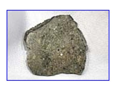
LOT NUMBER 26 WITNESSED FALL