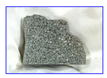
LOT NUMBER 28 WITNESSED FALL

Monroe The "Halloween meteorite" 56.4 grams Stone (H4) Cabarrus County, North Carolina Fell October 31, 1849 Estimate: $1,450 – 1,700