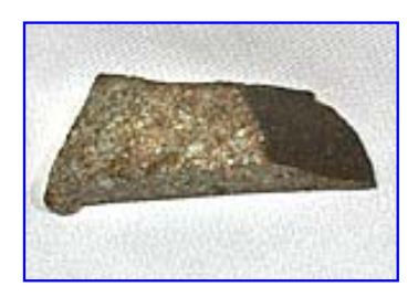
LOT NUMBER 19 WITNESSED FALL