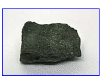
LOT NUMBER 31 WITNESSED FALL Mighei 4.8 grams

Marion (lowa) 66.2 grams Stone (L6 veined) Linn County, lowa Fell February 25, 1847 Estimate: $350 – 425