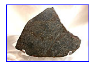
LOT NUMBER 42