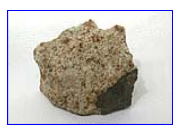
LOT NUMBER 32 WITNESSED FALL