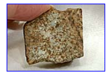
LOT NUMBER 57 WITNESSED FALL