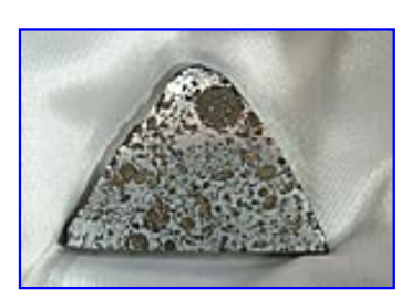
LOT NUMBER 35