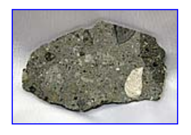
LOT NUMBER 74 WITNESSED FALL