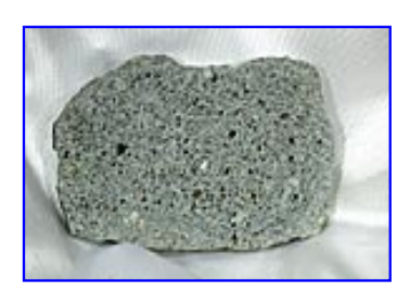
LOT NUMBER 41 WITNESSED FALL