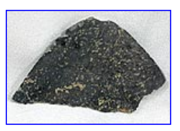
LOT NUMBER 55 LUNAR METEORITE

Northwest Africa 032 Complete lunar slice, diamond lap finish. Killer!