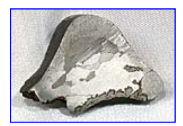
LOT NUMBER 15 WITNESSED FALL