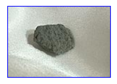
LOT NUMBER 54 WITNESSED FALL