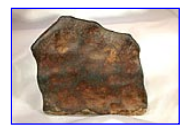
LOT NUMBER 53 WITNESSED FALL