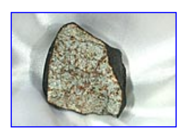
LOT NUMBER 34 WITNESSED FALL