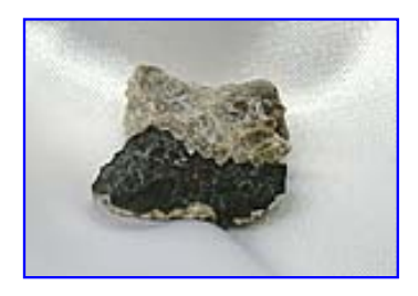
LOT NUMBER 24 WITNESSED FALL