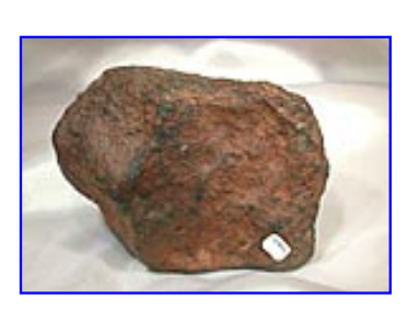
LOT NUMBER 50 WITNESSED FALL?