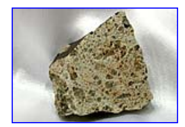
LOT NUMBER 27 WITNESSED FALL