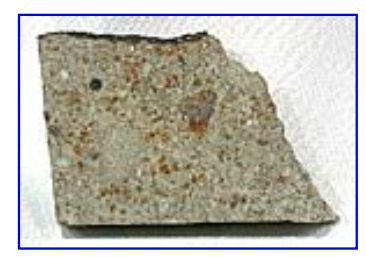
LOT NUMBER 33 WITNESSED FALL