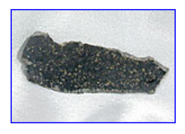
LOT NUMBER 68 LUNAR METEORITE

Pervomaisky Complete stone 98% crusted, museum #249 Stone (L6) 520 grams Vladimirskaya, Russia Fell December 26, 1933