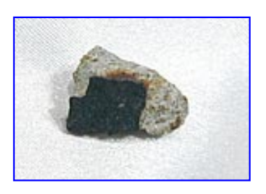
LOT NUMBER 64 WITNESSED FALL

Stone (L6) 546 grams AMNH #1501 Navajo County, Arizona, USA Witnessed fall, July 19, 1912