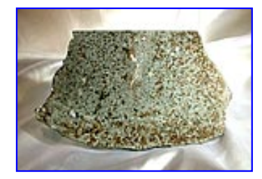
LOT NUMBER 45 WITNESSED FALL