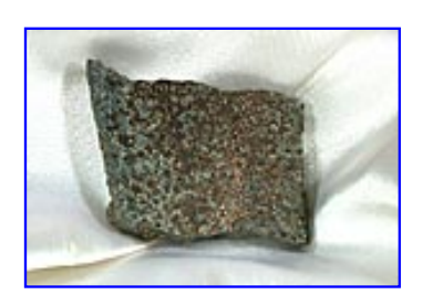
LOT NUMBER 7 WITNESSED FALL