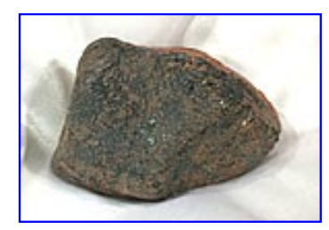
LOT NUMBER 9 WITNESSED FALL