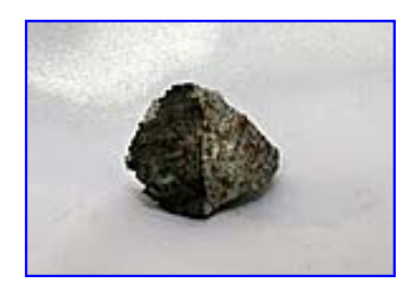
LOT NUMBER 51 WITNESSED FALL