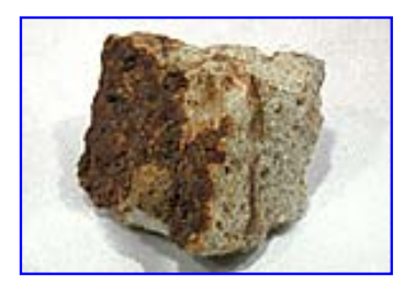
LOT NUMBER 72