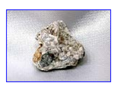
LOT NUMBER 46 WITNESSED FALL