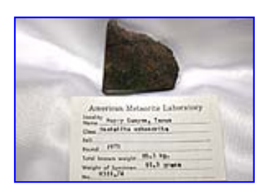
LOT NUMBER 23 WITNESSED FALL