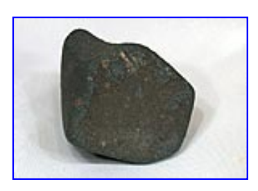
LOT NUMBER 52 WITNESSED FALL