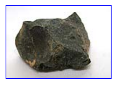
LOT NUMBER 71