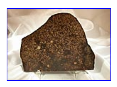
LOT NUMBER 37