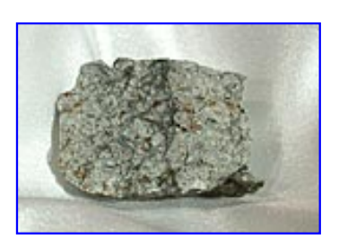
LOT NUMBER 49 WITNESSED FALL