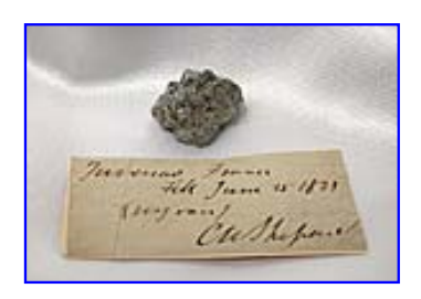
LOT NUMBER 59 WITNESSED FALL

Juvinas With vintage handwritten, signed C. U. Shepard label Stone Achondrite, Eucrite 4.0 grams Ardeche, France Fell June 15,1821