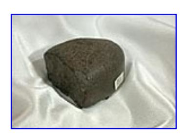
LOT NUMBER 20

Dar al Gani 194 147.8 grams 95% fusion-crusted, extremely attractive stone. Stone (CO3) Found Hammadah al Hamra, Libya