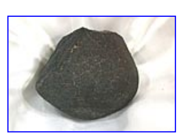
LOT NUMBER 38 WITNESSED FALL