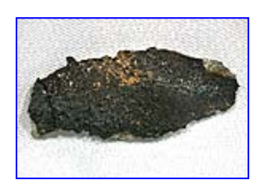
LOT NUMBER 16 WITNESSED FALL