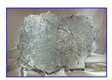
LOT NUMBER 14