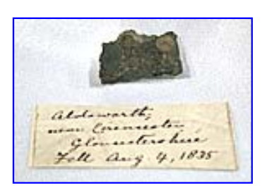
LOT NUMBER 10 WITNESSED FALL