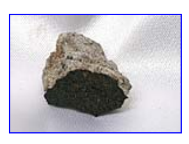
LOT NUMBER 58 WITNESSED FALL