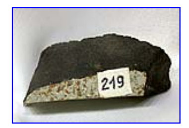
LOT NUMBER 39 WITNESSED FALL