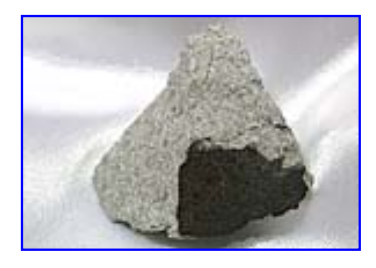
Harleton Stone (L6) 20.6 grams partially crusted

Harrison County, Texas Fell May 30, 1961