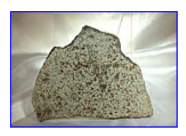
LOT NUMBER 40 WITNESSED FALL

Noyan-Bogdo This is the largest slice cut from the main mass