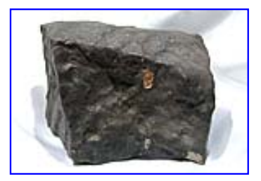
LOT NUMBER 69 WITNESSED FALL