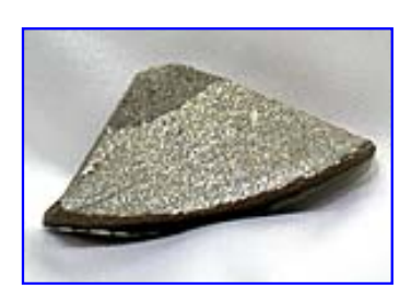
LOT NUMBER 25 WITNESSED FALL