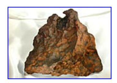
LOT NUMBER 70

Dewey County, Oklahoma, USA Fell November 25, 1943 Note: This actual stone featured on "Meteorites A to Z" poster