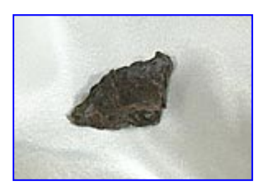
LOT NUMBER 48 WITNESSED FALL(?)