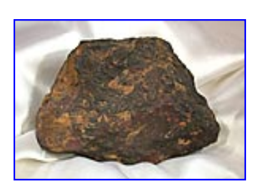
LOT NUMBER 44