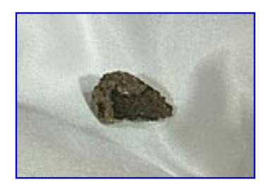
LOT NUMBER 12 WITNESSED FALL

Coconino County, Arizona Estimate: $2,000 – 2,300