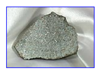
LOT NUMBER 47 WITNESSED FALL