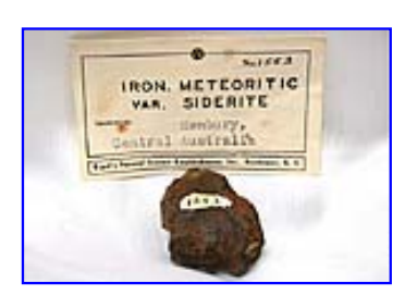
LOT NUMBER 4