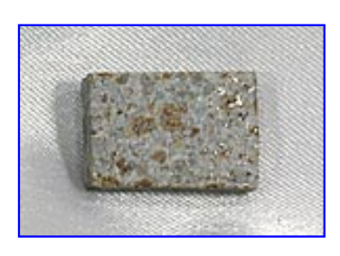
Wold Cottage Stone (L6) 2.2 grams Dimensions: 4mm x 10mm x 15.5mm Yorkshire, England Fell December 13, 1795