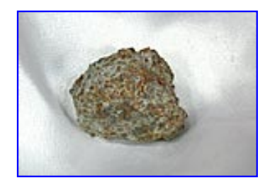
LOT NUMBER 21 WITNESSED FALL